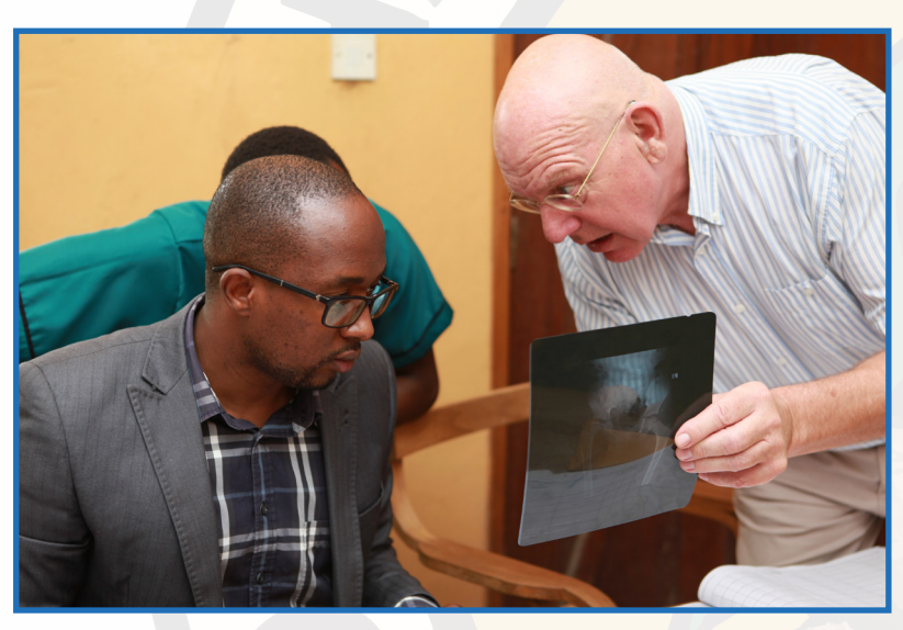
Sharing knowledge makes the work interesting

The largest group of people the doctor treats are children with ailments due to malnutrition in Uganda and victims of traffic accidents in Suriname. "If you look at Suriname, the roads there are simply bad. Moreover, alcohol is regularly involved and the driving behaviour of the population is downright reckless. As a result, there are many and often very serious accidents." The victims who end up on the doctor's operating table are often in poor condition. "Recently there was a man whose hip was broken in so many places that I first started looking for a solution on the internet. As doctors, we work with gradations, which indicate how serious a fracture is. The severity of this man's fractures, that gradation simply did not exist. There was no online help. I had to solve it myself. And it worked, he can walk again."