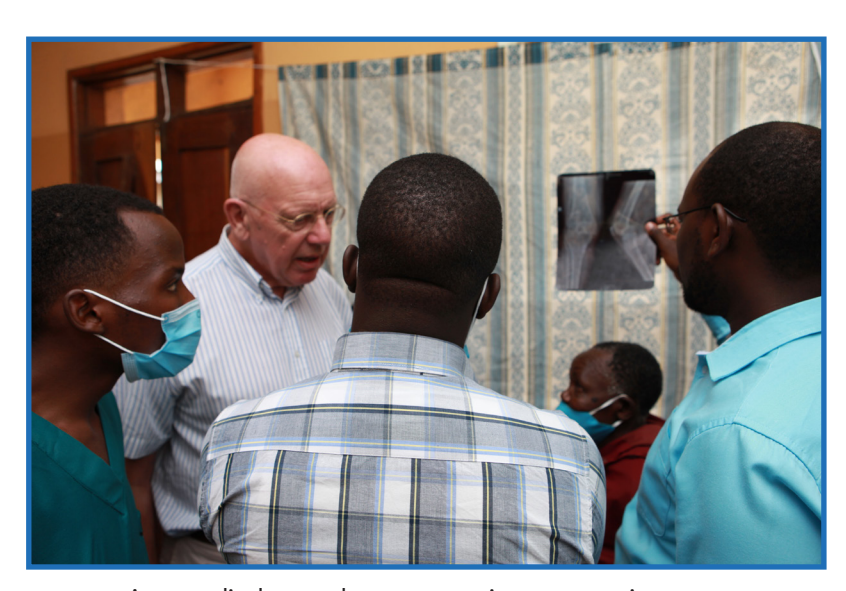
As a medical team they can examine many patients