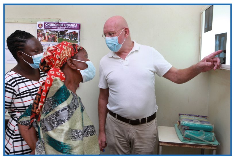
The patients are very happy to have the mzungu doctor at the hospital